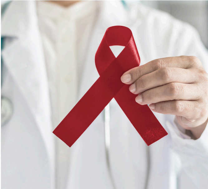
Dr. Gerri-Cannon Smith

There are several pathways linking climate change to human health, and they include air pollution, decreased air quality, increased allergens, environmental degradation, expanding vector-borne illness transmission, decreases in food and water quality and security, more frequent and increased climate-related disasters and extremes of weather.